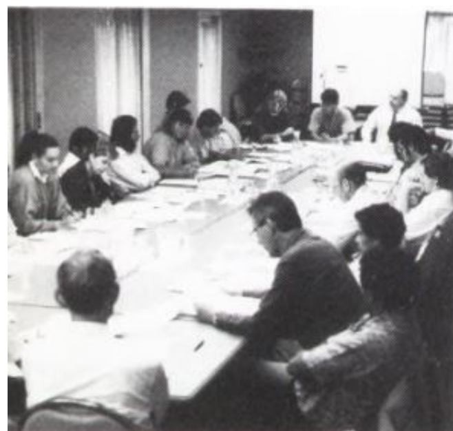
Participants at the 1992 workshop: A national survey of Aboriginal and Islander populations: problems and prospects, jointly sponsored with CAEPR