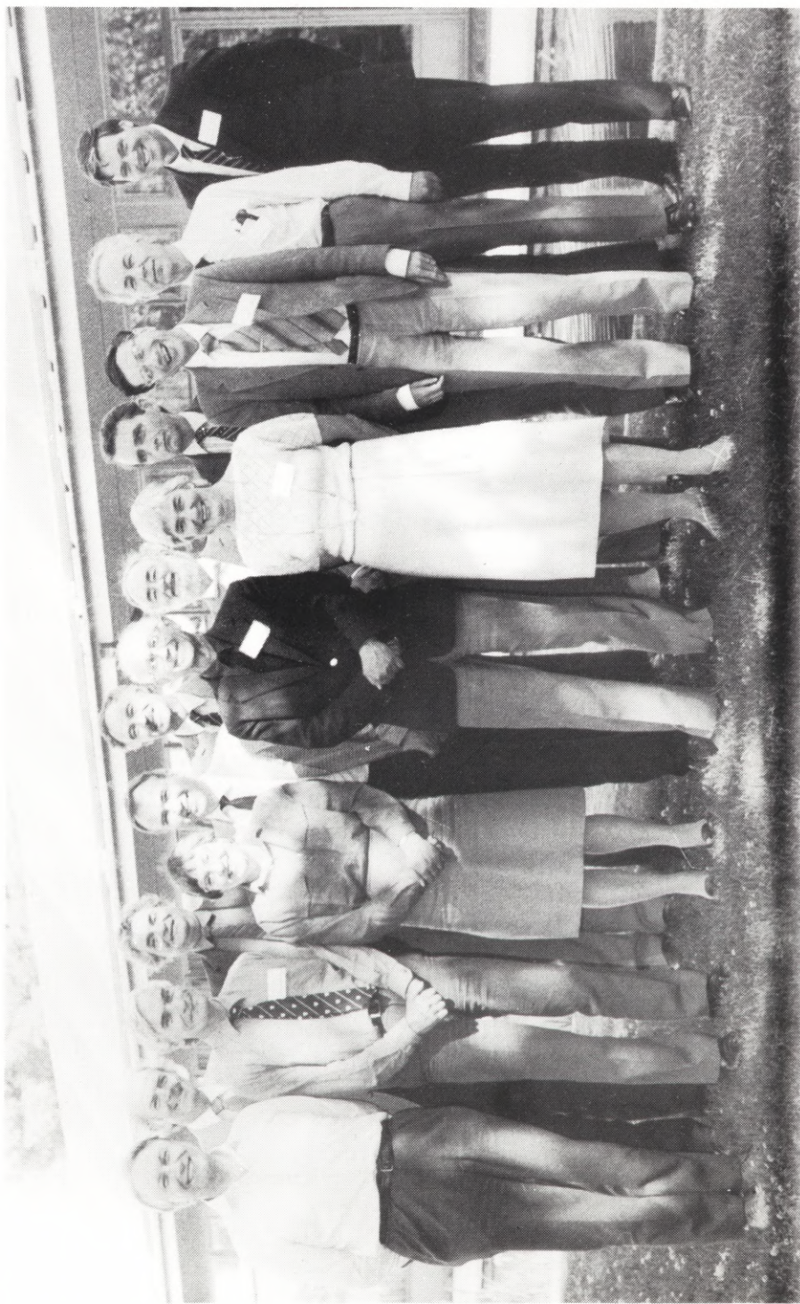
Members of the Executive Committee, the Standing Research Committee and Branch Conveners