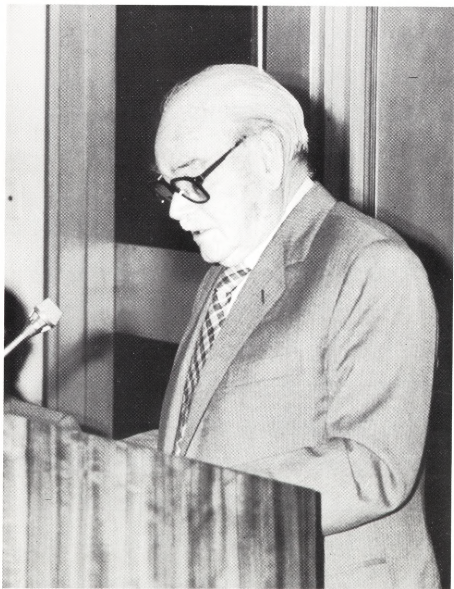
The Rt Hon Sir Paul Hasluck delivering the 1986 Academy Lecture