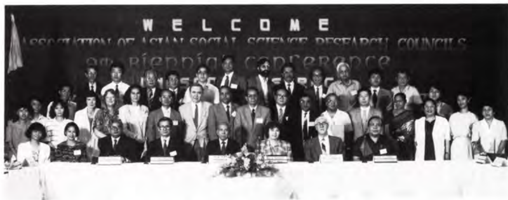
Participants at the Biennial Conference and AASSREC-UNESCO Symposium on Human Resource Development in Manila, August 1991.