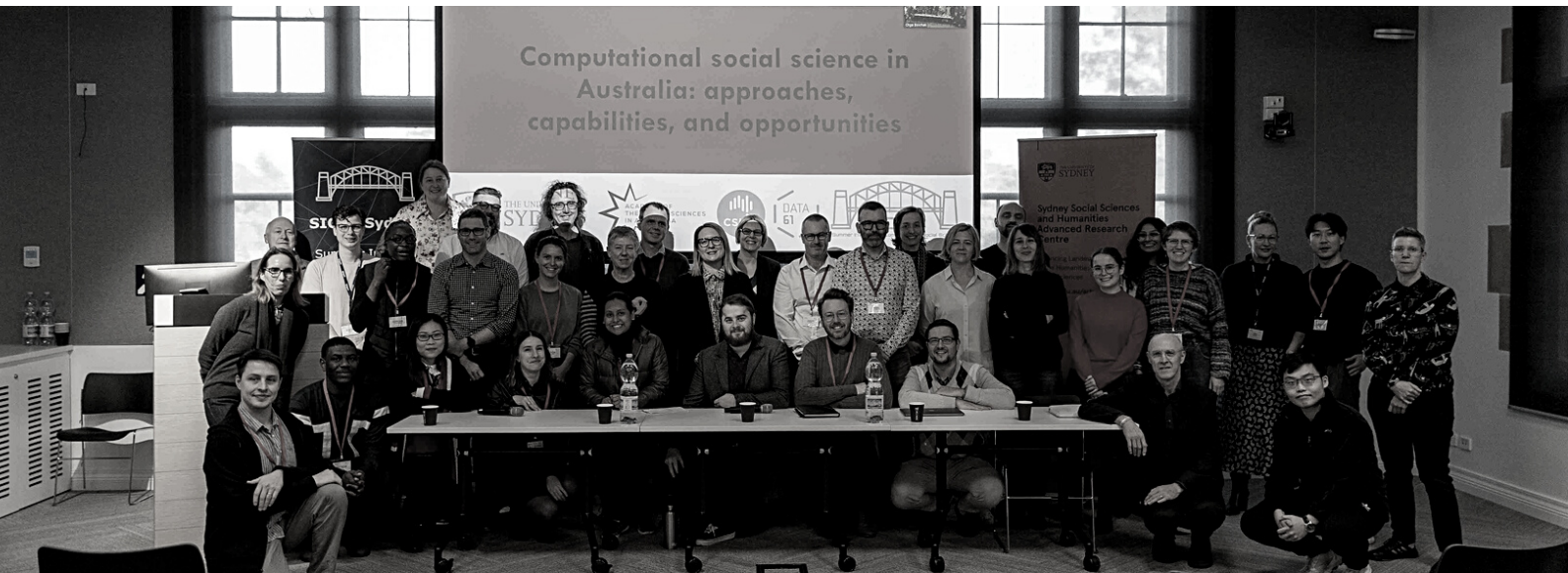
Participants at the 2022 Computational social science in Australia workshop

The budget should include the amount requested from the Academy and secured from other funding sources (both financial and in-kind contributions). Applicants are encouraged to seek matched or additional funding from universities or other parties and the Academy welcomes co-badging of workshops.