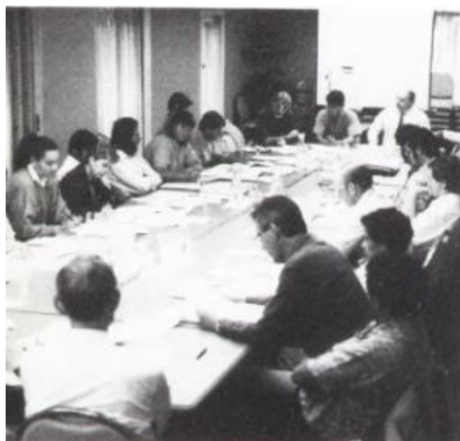
Participants at the 1992 workshop: A national survey of Aboriginal and Islander populations: problems and prospects, jointly sponsored with CAEPR

Over the past 30 years the Academy has supported over 190 workshops involving thousands of leading experts across Australia. It continues to be an exciting and integral means of delivering on the Academy's goal to recognise and champion excellence in the social sciences.