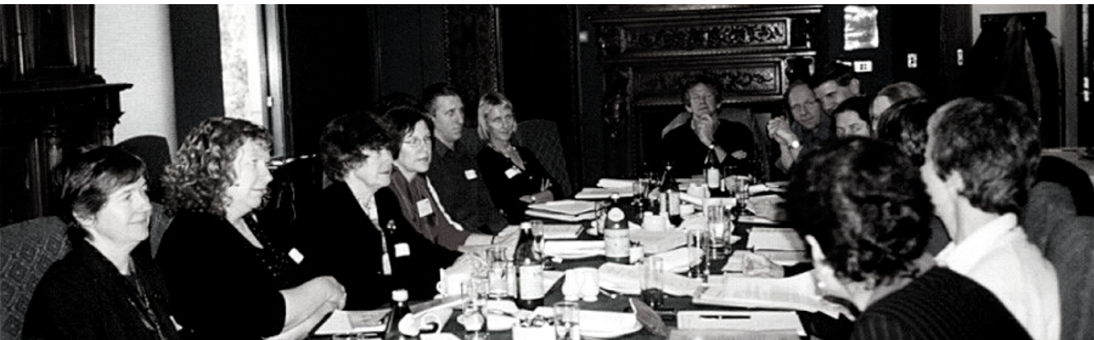
Participants at the 2002 workshop: Investing in our children: developing a research agenda, Melbourne