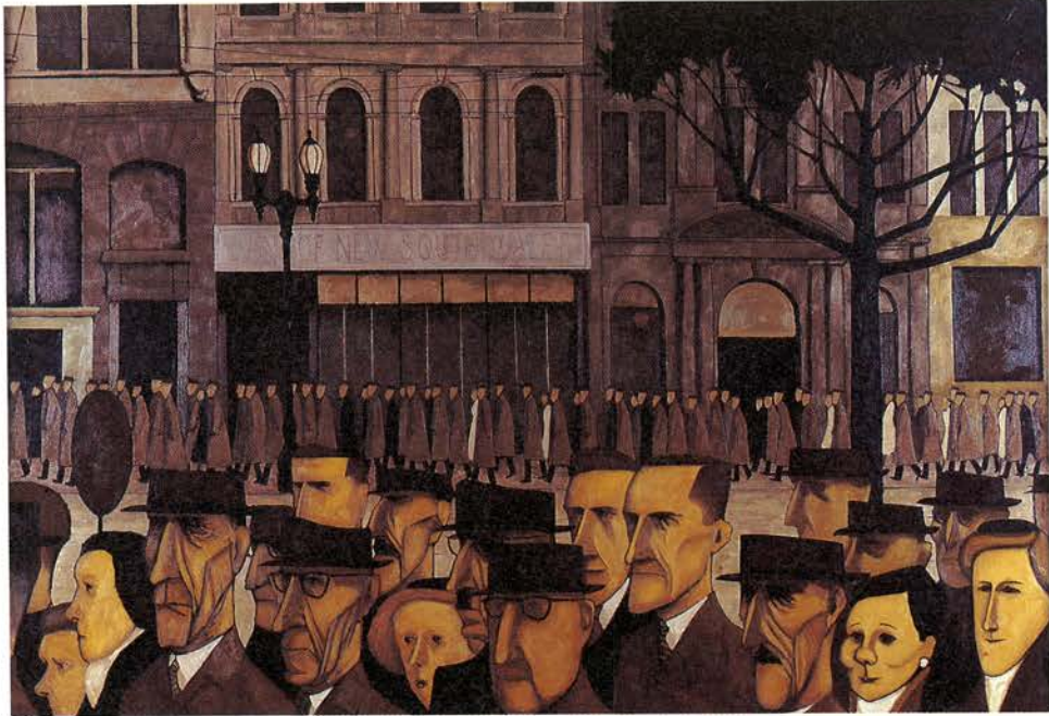
John Brack, Collins Street, 5 p.m., 1956. Oil on canvas.