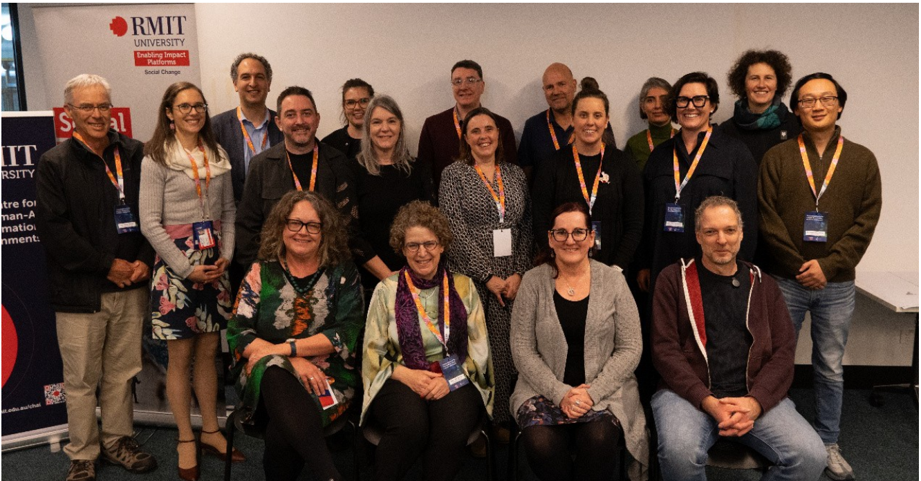
WORKSHOP FACILITATORS AND PARTICIPANTS